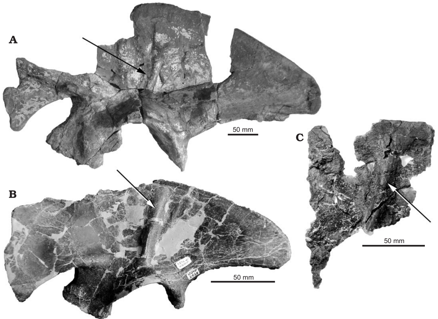
Fig. 1. Ili of basal non-tyrannosaurid tyrannosauroids with a posterodorsally inclined ridge on the lateral surface of the ilium. A. Right ilium (reversed) of Juratyran langhami Benson, 2008 (OUMNH J.3311-21), Kimmeridge Clay, Dorset England, Late Jurassic (early Tithonian). B. Left ilium of Stokesosaurus clevelandi , Madsen 1974 (UMNH VP 7473), Morrison Formation, Utah, USA, Late Jurassic (early Tithonian). C. Left ilium of Eotyrannus lengi Hutt, Naish, Martill, Barker, and Newberry, 2001 (MIWG 1997.550), Wessex Formation, Isle of Wight, England, Early Cretaceous (Barremian). All in lateral view. Arrows denote the lateral ridge.

this genus (Hutt et al. 2001) and has yet to be mentioned in the literature (MIWG 1997.550) (Fig. 1C). Although fragmentary, the specimen is identified as a left ilium because the base of one of the ventral peduncles is preserved, and it is mediolaterally narrow like the pubic peduncle of tyrannosauroids and other coelurosauroids but unlike the thicker and more conical ischial peduncle (e.g., Brochu 2003; Rauhut 2003b). A linear ridge is present, well preserved, and well developed on the lateral surface of the blade, and it extends strongly posterodorsally at approximately the same angle as seen in Stokesosaurus clevelandi and “ S. ” langhami . Therefore, a posterodorsally-inclined iliac ridge can no longer be considered as a unique synapomorphy of a monophyletic Stokesosaurus .