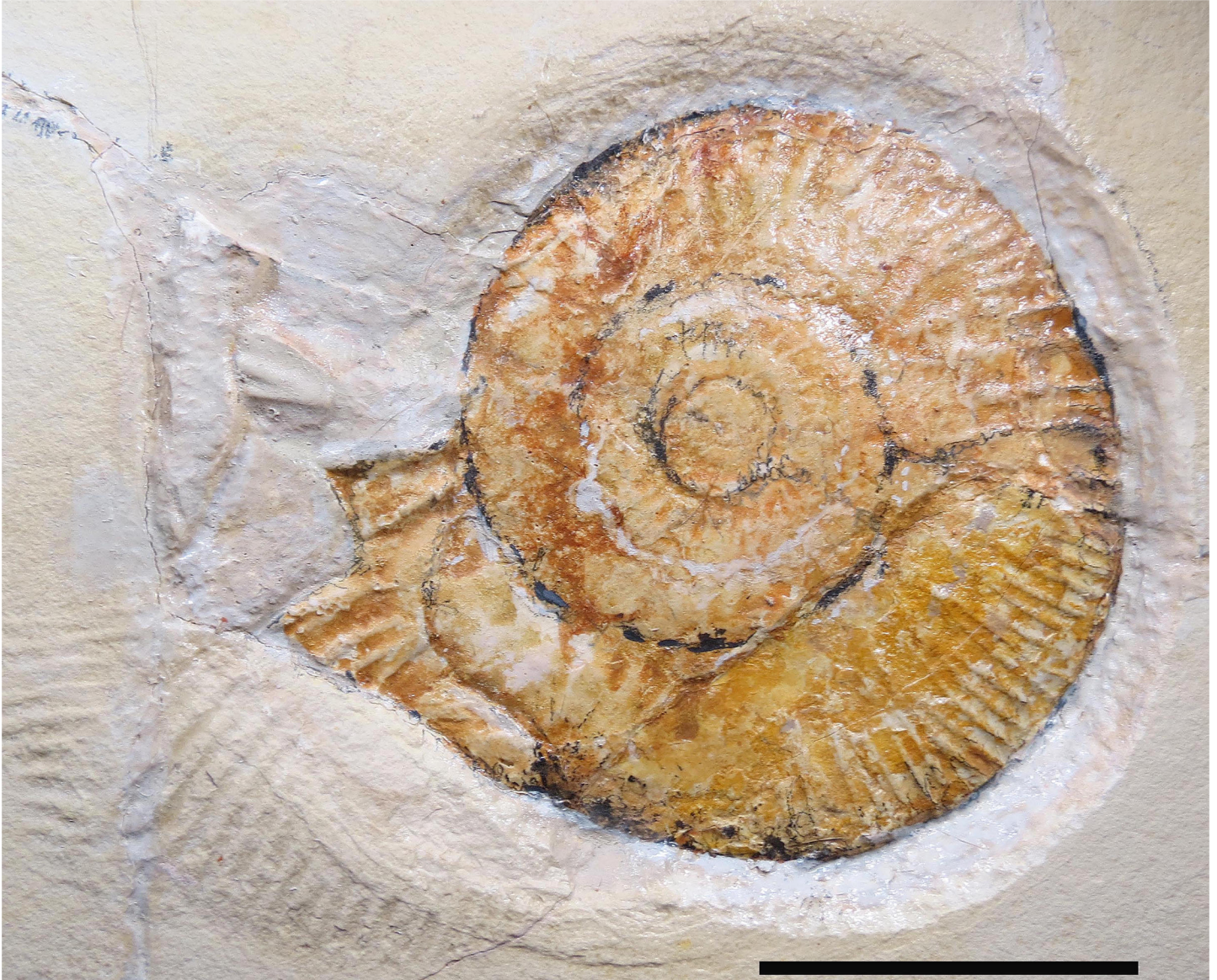
Fig 3. The ammonite Subplanites rueppellianus , the producer of the drag mark (MCFO 0492). Note the touch down mark which changes the orientation (and number) of the ridges in the substrate, anteroventral to the ammonite. Scale measures 5 cm.

https://doi.org/10.1371/journal.pone.0175426.g003