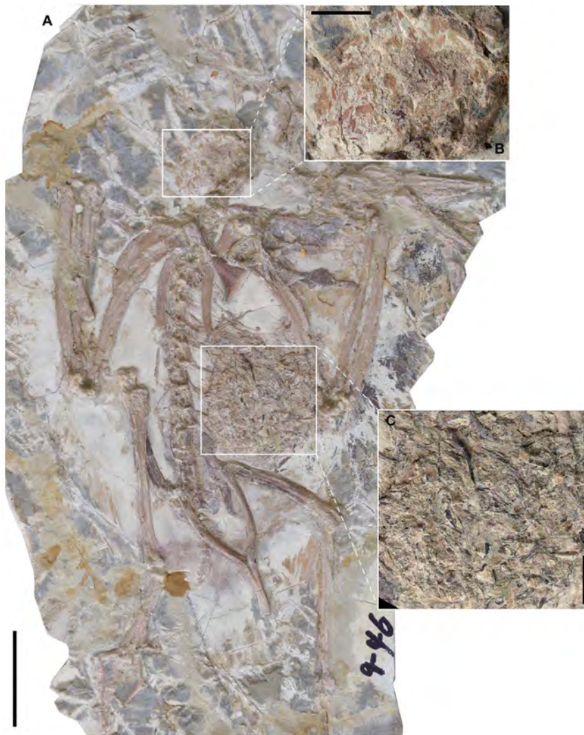
Figure 2. Yanornis STM9-46 preserving macerated fish bones in the crop and ventriculus: (A) full slab, scale bar equals four cm; (B) detail of the crop, scale bar equals one cm; (C) detail of the ventriculus, scale bar equals one mm. doi:10.1371/journal.pone.0095036.g002

several of these are related to the loss of teeth [10]. The basal ornithuromorph Archaeorhynchus is edentulous, possessing several morphological indicators of herbivory, and also preserves geogastrolith gizzard stones in all specimens [3,14], thus direct evidence and morphological indicators concur. However, most Yanornis specimens preserve fish remains and do not preserve gastroliths, although two specimens do preserve the latter feature (IVPP V13558, STM9-51). Furthermore, morphological indicators for herbivory are absent; Yanornis possesses the most robust, sectorial dentition of any Early Cretaceous ornithuromorph and a greater number of teeth than any Early Cretaceous bird. Furthermore, in light of new comparative material, the gastroliths preserved in Yanornis show some peculiarities. In specimens of Archaeorhynchus the gizzard stones are all similar in size (2 mm), whereas in IVPP V13558 the stones range from 0.2–2.7 mm, and a large number of them are smaller than the gizzard stones preserved in Hongshanornis (~1 mm), a much smaller taxon [7]. The stones are also far more numerous in IVPP V13558. While nearly every other specimen with gastroliths is preserved in dorsoventral view, showing a small, dense, round mass of stones