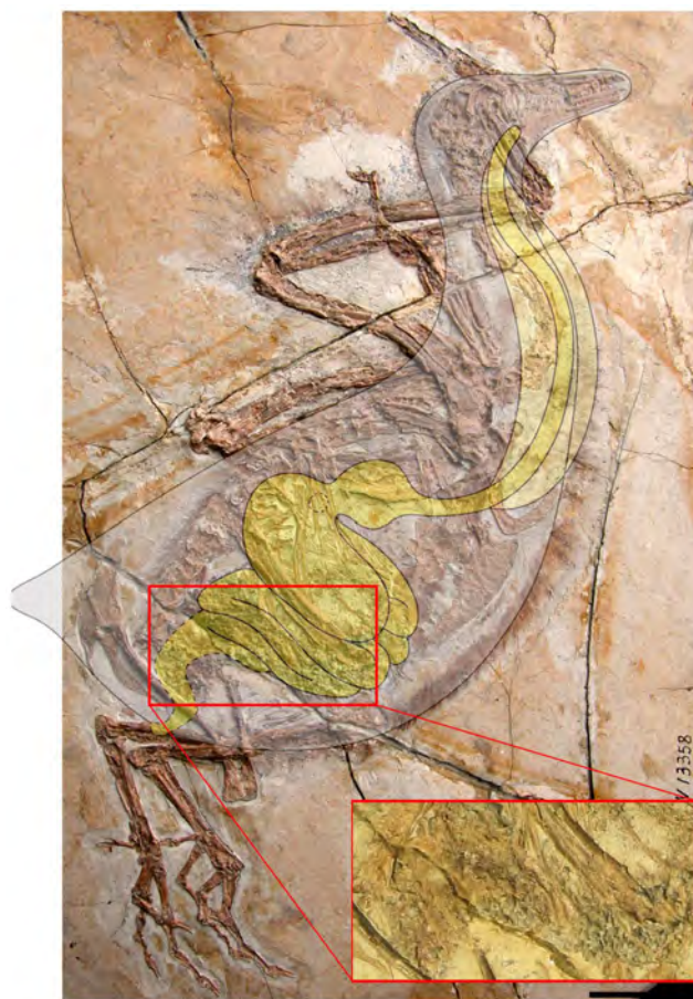
Figure 4. Interpretative drawing of the alimentary canal of Yanornis superimposed over IVPP V13558. Enlarged red box shows preservation of sand compacted in the intestines. The grit is clearly too caudally located to represent gizzard stones. The oesophagus is drawn in a way to demonstrate its flexibility; it leads to the small proventriculus (pyloric sphincter indicated by dashed circle), followed by the larger ventriculus, and then the intestines and cloaca. Scale bar equals 1 cm.