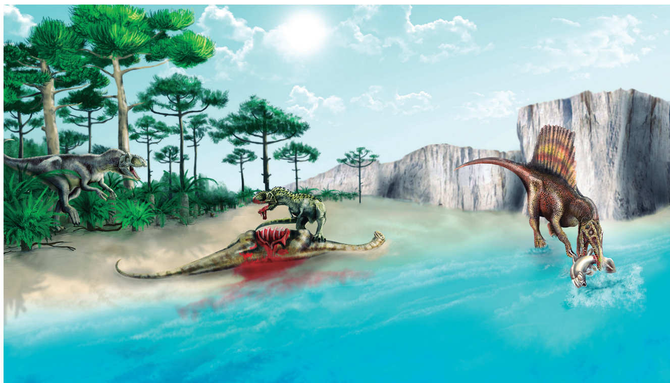
Figure 3. Paleoenvironmental reconstruction of large theropods from middle Cretaceous North Africa showing carcharodontosaurid (left), abelisaurid (middle) and spinosaurid theropod (right) feeding. Drawing made by L. Vidal.